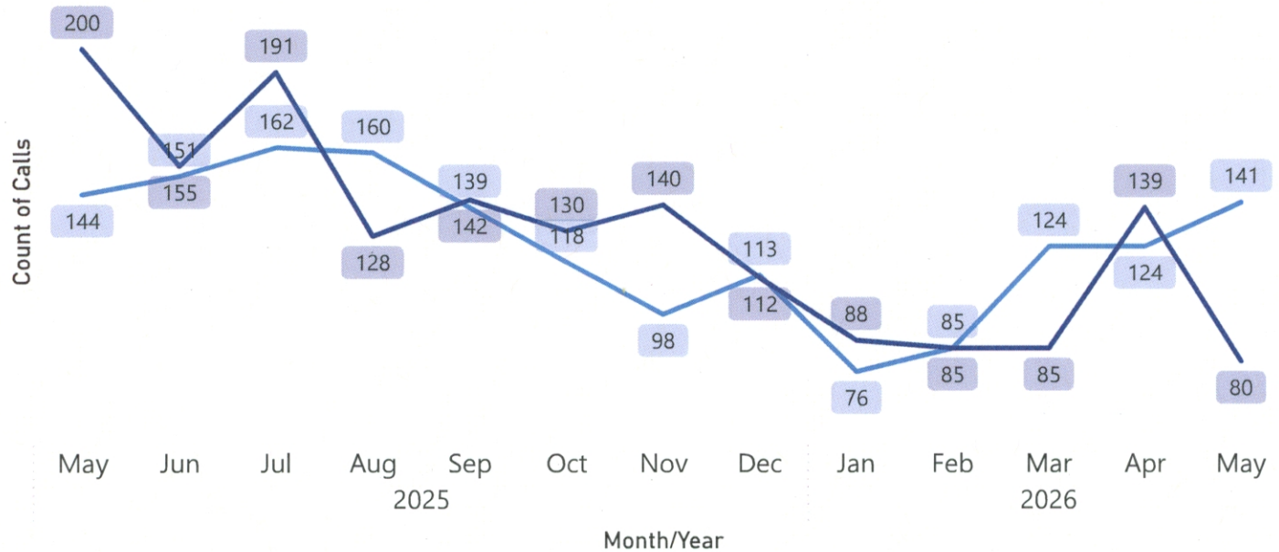
Figure 8: District V1 Calls - May 2026 Snapshot